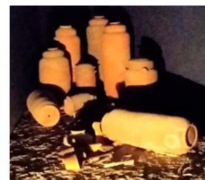
Kumran Israel, scroll containers.